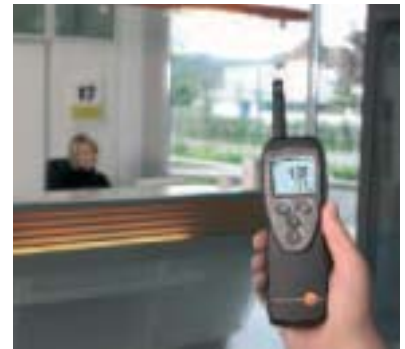
testo 625 with attached moisture probe head, e.g. for monitoring room climate