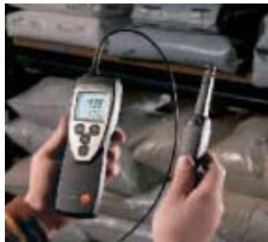
Moisture probe head via handle with probe wire, e.g. for monitoring warehouse climate