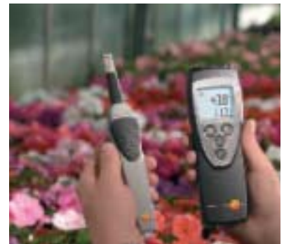
Moisture probe head attached to radio handle e.g. for monitoring climate regulation

testo 625, humidity/temperature measuring instrument, incl. plug-in humidity probe head, battery and calibration protocol