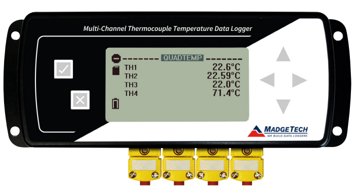
*Thermocouple Plugs/Probes Sold Separately

The QuadTCTemp2000V2 is a four channel thermocouple data logger with an LCD display. The device features on-screen minimum, maximum and average statistics, as well as a user configurable graphics screen that allows for any combination of channels to be displayed. The device accepts J, K, T, E, R, S, B and N type thermocouples.