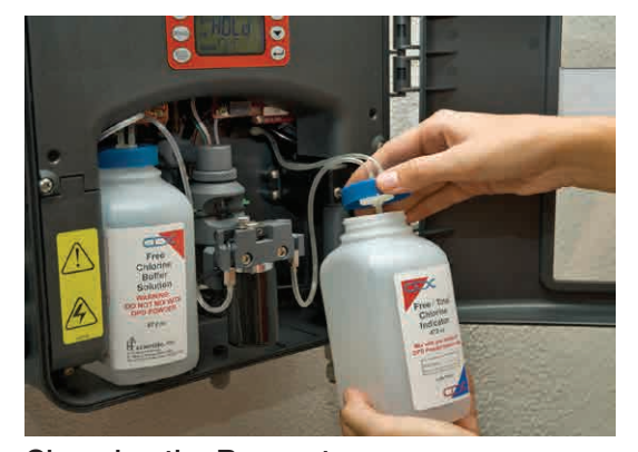
Changing the Reagents

The Residual Chlorine Monitor shall be able to measure free or total chlorine using the DPD colorimetric method. The Chlorine Monitor shall have a measurement range of 0-10 mg/l. The Chlorine Monitor shall include the power supply, sensor and display in one NEMA 4X (IP66) corrosion resistant enclosure. The Chlorine Monitor shall have readings consistent with laboratory and portable Chlorine Photometers. The Chlorine Monitor shall have standard 4-20 mA outputs and RS-485 with Modbus Protocol. The 4-20 mA output shall be standard or reversible. The Chlorine Analyzer shall have a removable sample cuvette. The sensor shall have a clear view to the optical chamber allowing viewing of the sample and reaction of the reagents, before, during and after a reading. Accuracy shall be ±5% with a resolution of 0.01 mg/l for the range of 0-6 mg/l and \pm 10\% with a resolution of 0.01 mg/l for the range of 6-10 mg/l. The Chlorine Monitor shall have a user selectable cycle time between 110 seconds and 10 minutes (optional 60 seconds to 10 minutes). The Chlorine Monitor shall be capable of 30 days of unattended operation. The Chlorine Monitor shall take a zero reading before each reading to compensate for color in the sample. The Chlorine Monitor shall have microprocessor based technology. The Monitor shall have two user selectable alarm relays.