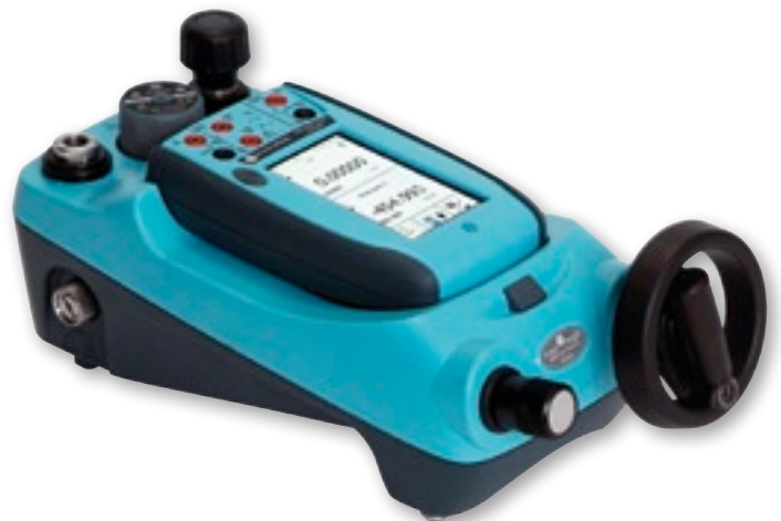
Re-rangeable pressure measurement and generation from 25 mbar (10 inH 2 O) to 1000 bar (15000 psi)