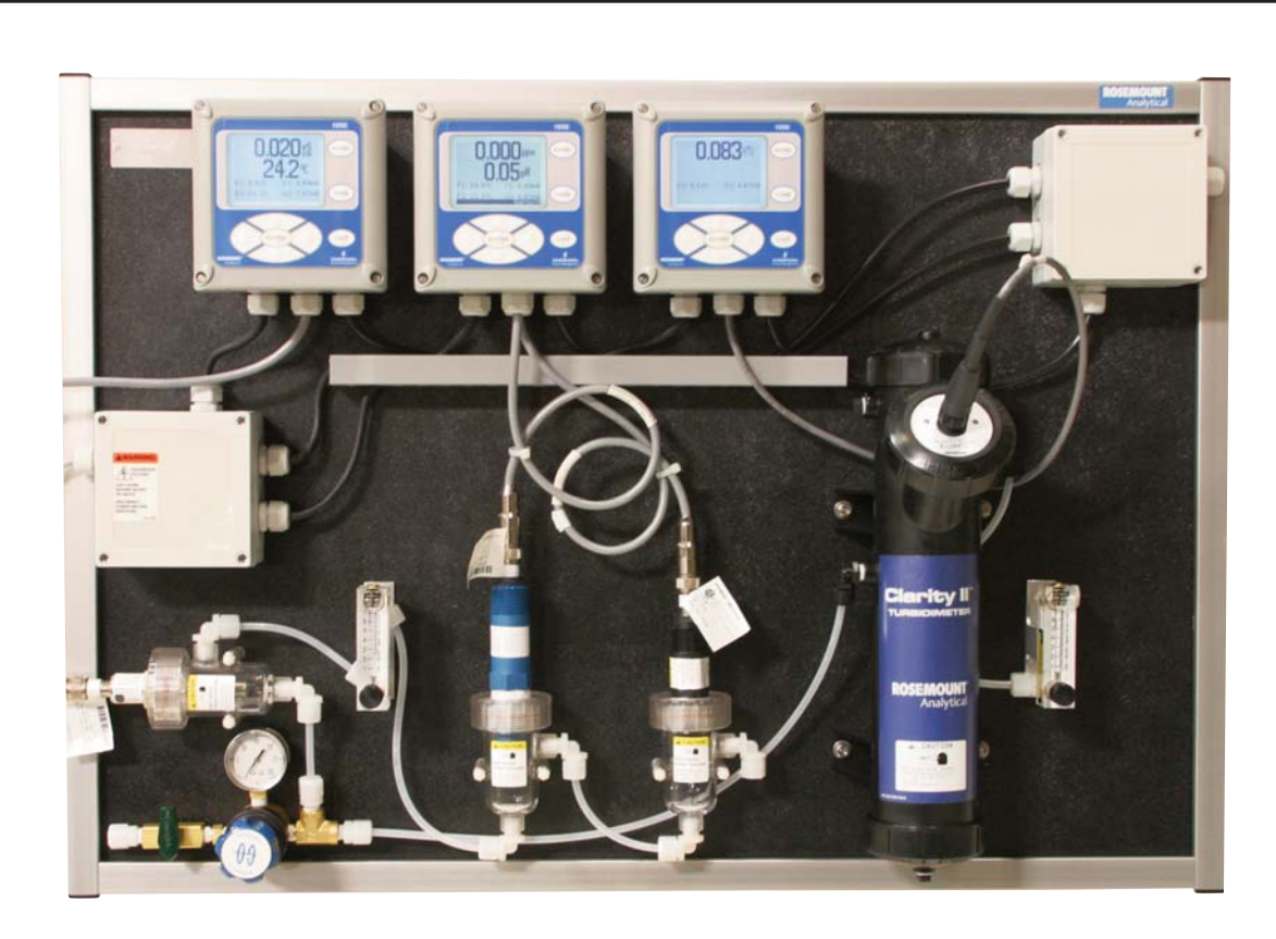
Electrochemical Water Quality System