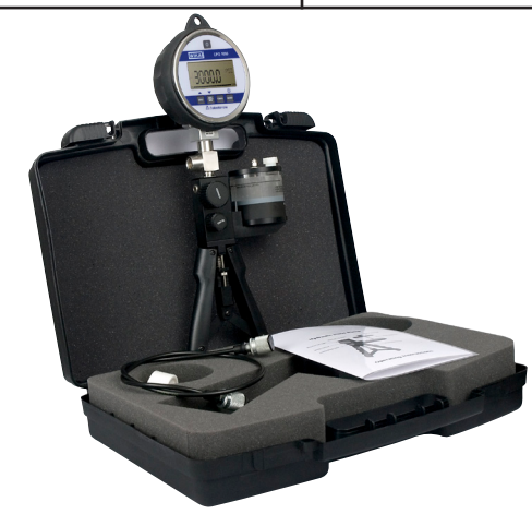
WICP-H10K Pneumatic Pump Kit (shown with CPG 1000)