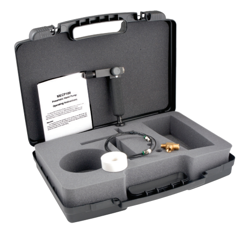
WICP-L100 Pneumatic Pump Kit