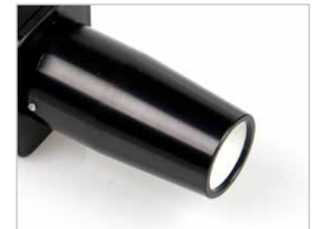
Close focus module