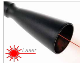
Long range module