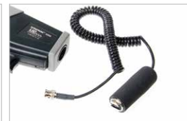
RAS - Magnetic Mount