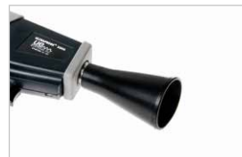
Long range module