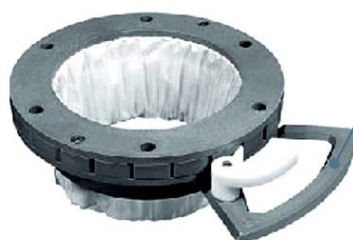
Full Port Design