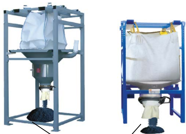
Full Port Design