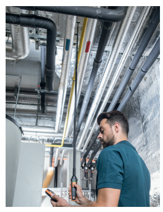
All testo 440 air velocity probes for measurements in ducts have an optional scaled, extendible telescope (extends from 3 to 6.5 feet).