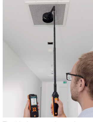
The 4 inch vane probe can be easily combined with the 90° angle and telescope, making measurements at ceiling outlets easier.