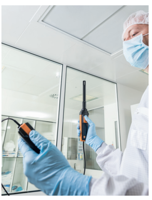
Do you need to carry out measurements in places where Bluetooth isn't possible? No problem: simply switch the probe head over from Bluetooth to the cable handle and you're ready to go.