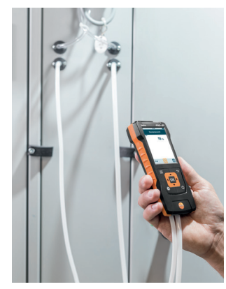
With the testo 440 dP model, which includes a differential pressure sensor, you can ensure that the filters in air conditioning systems are working properly and no contamination in the outdoor air contamination gets indoors.