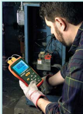
Dual Type K inputs ideal for use in furnace evaluation, HVAC and Superheat measurements