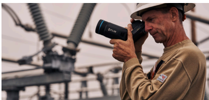
Assess the state of equipment from a safe distance, at any angle, or in any lighting condition