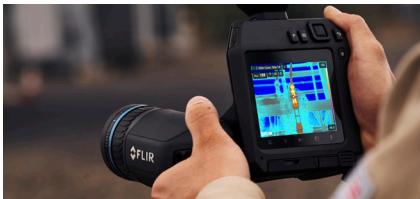
Collect and manage critical data quickly and easily