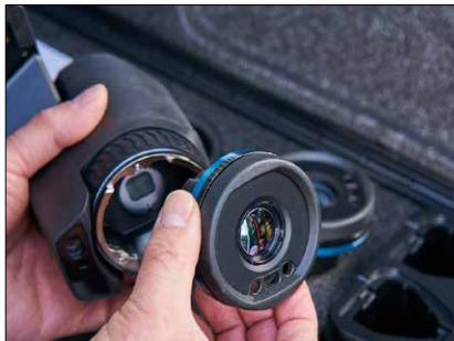
Share lenses (wide angle to telephoto) across your fleet of cameras thanks to AutoCal™ optics