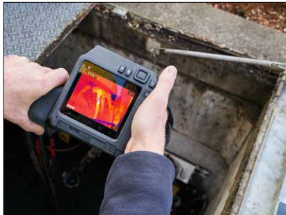
Up to 161,472 pixel resolution for accurate readings on distant targets