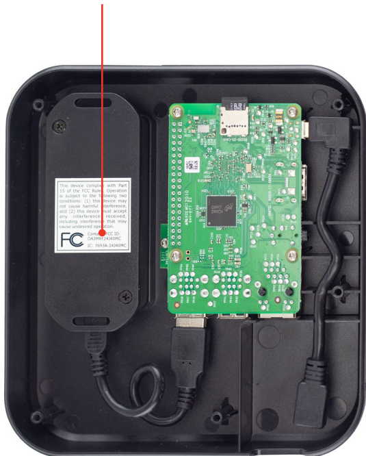
1a. Wireless Transceiver