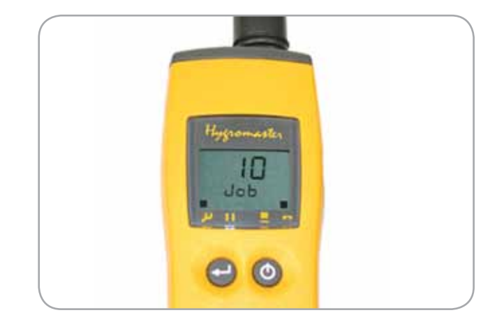
Assign job numbers to data