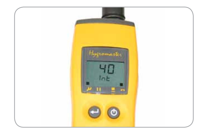
Set interval 1 minute to 24 hours