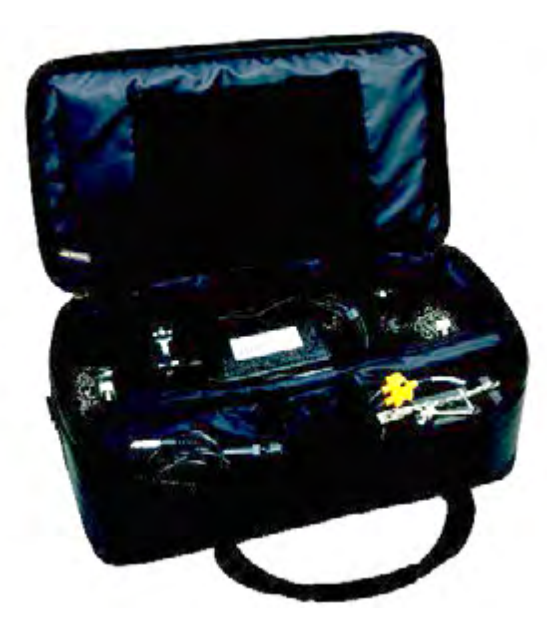
Standard soft shell carrying case