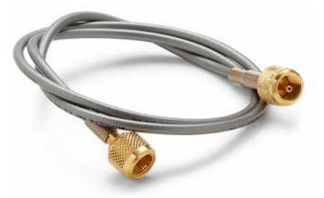
Pressure Fitting Kit Adapts from Quick-test<sup>™</sup> hose to 1/4" male & female NPT, 1/8" male & female NPT and 1/4" tube fitting

Microbore hoses provide a very quick, low volume, high pressure way of connecting any pressure instrumentation to the hand pump and pressure module.