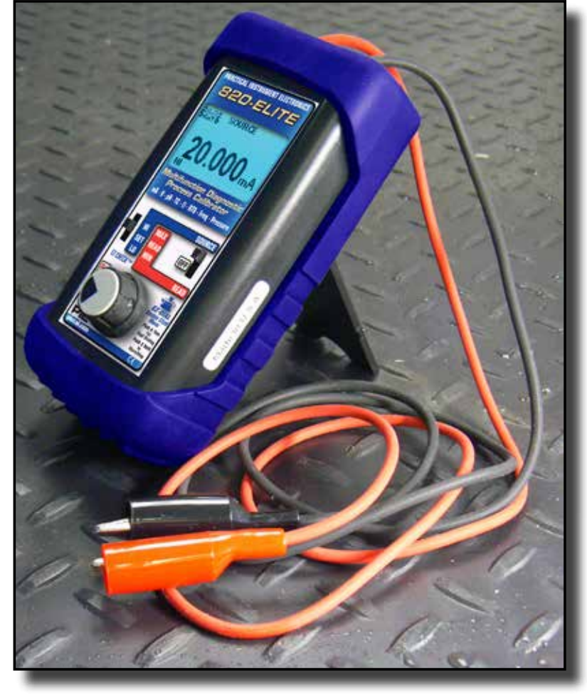
Flip out stand for bench use

• Easy to use on the bench or in the field The rubber boot provides more than protection...flip out the tilt stand when you need to set it on your work bench. Free up BOTH hands when you work on the plant floor or in the field. Especially handy when you have to hang onto a ladder or railing while calibrating.