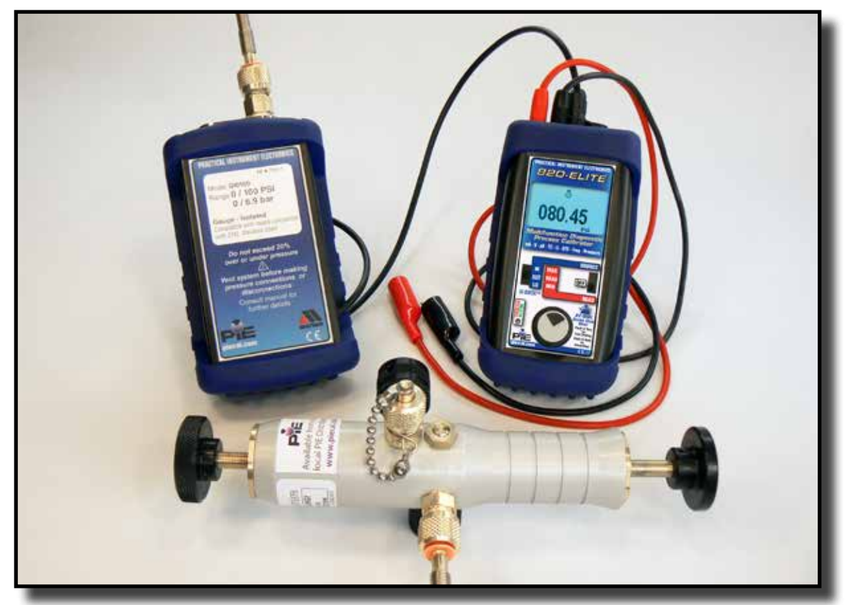
PIE 820-ELITE with Pressure Module, Pressure/Vacuum Pump & Hose

PSI • inches, feet, mm, cm and meter of H2O @ 4°C, 20°C & 60°F • inches, meter, cm and mm of Hg @ 0°C; torr • kg/cm2 • kg/m2 • Pa • hPa • kPa • MPa • Bar • mBar • ATM • oz/in2 • lb/ft2