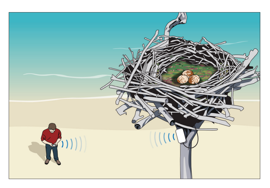
The above illustration depicts using a mobile device to easily download data from a BLE data logger in a hard-to-reach location.

For users weighing both BLE and USB field temp/RH data logger options, a range of important factors should be considered. The following topics represent key drivers to evaluate when deciding which option is more appropriate.