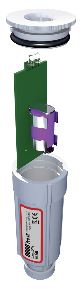
The HOBO U23 Temperature/RH Data Logger offers convenient user-replaceable battery.