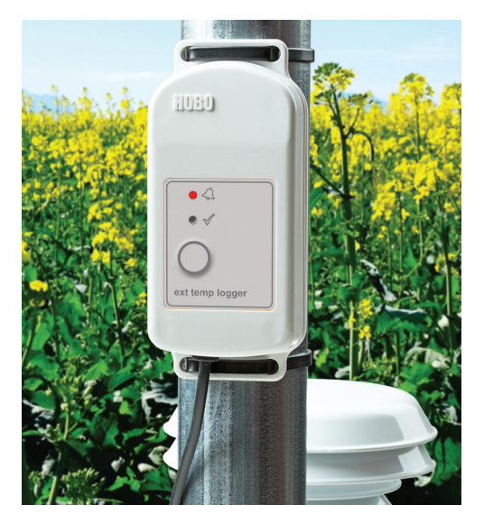
Above photo shows the MX2304 external temperature data logger with an alarm status, indicating a set temperature threshold has been exceeded.