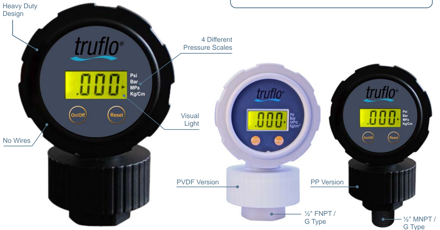
All Plastic Design (Gauge + Isolator)