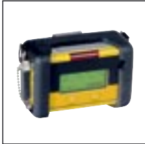
Multi-gas detector with “voice” assist for added safety