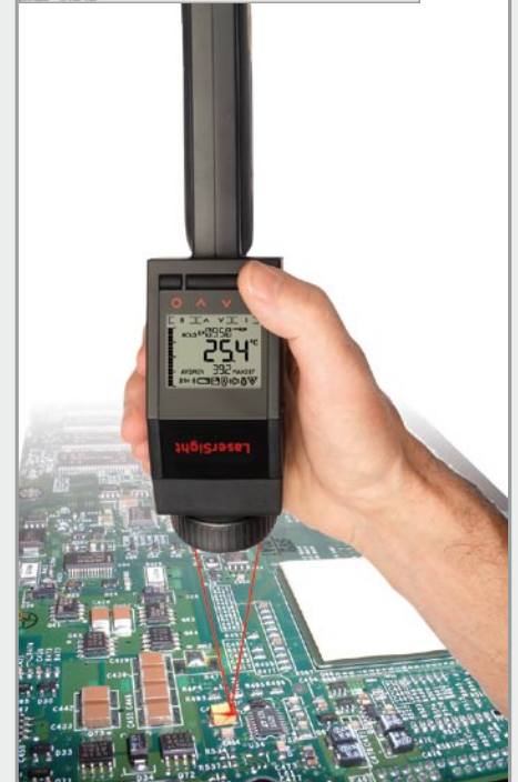
Flip display for multi purposes: Measurement of smallest objects (1mm) on a circuit board - data transfer via USB to a common PC