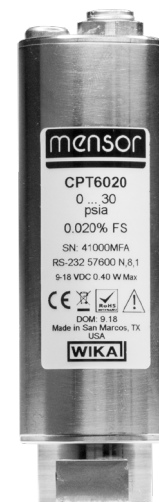
Precision Pressure Transducer, Model CPT6020