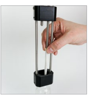
6. Slide the sock onto the 5-inch probe.