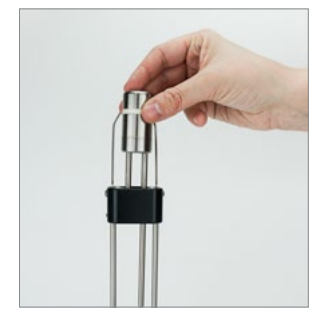
5. Insert the LCS140 data logger into the hanging fixture so it is suspended upside down.