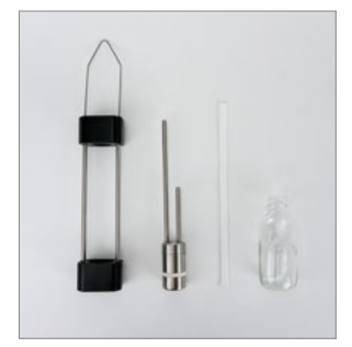
1. Remove all components from the packaging.