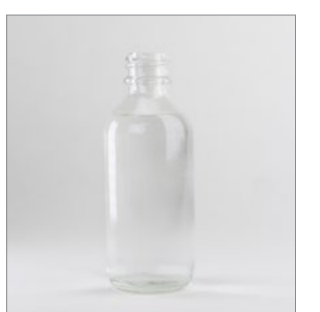
Fill the reservoir bottle with distilled water, approximately 2 oz (60 ml).