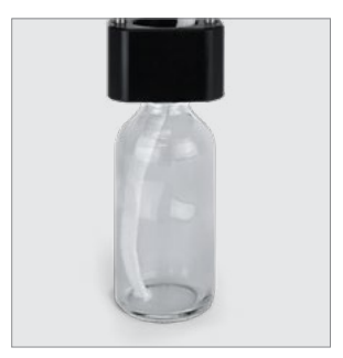
8. Adjust the sock on the probe so that it touches the bottom of the water reservoir.