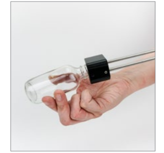
3. Screw the reservoir bottle into the bottom of the hanging fixture.