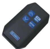
IR Remote Controller RIS-15