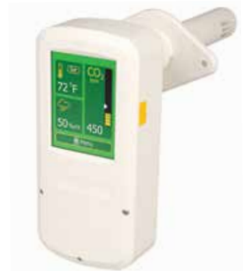
Ductmount Kit – Gain maximum flexibility for installation

USB Port – Update display graphics with logo and contact information; allow future uploads of product enhancements