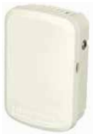
LED (non-display model only) View at-a-glance normal or fault state status

Calibration Port – Connect calibration tube for fast, accurate bump test; calibrate IAQPoint2 without opening the casing