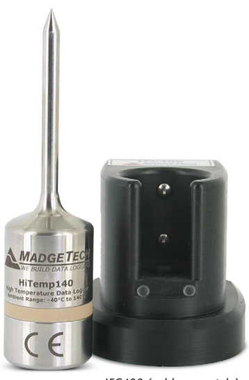
IFC400 (sold separately)

The HiTemp140 can store up to 32,700 readings, and features a rigid external probe capable of measuring extended temperatures, up to 260 °C (500 °F). Custom probe lengths are available up to 7 inches. The device records date and time stamped readings, and has non-volatile solid state memory which retains data even if the battery becomes discharged.