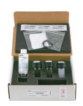
Calibration Kit, 100, 10 & 0.02 NTU/FNU