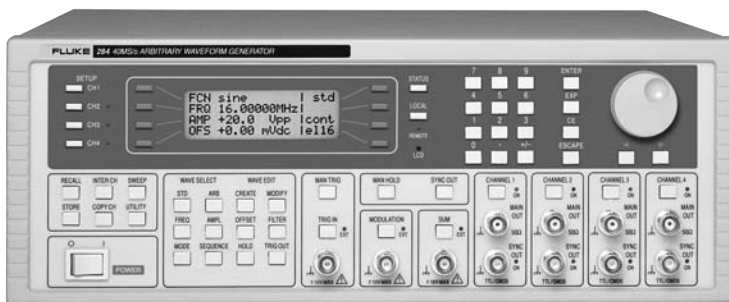
284 Waveform Generator

These universal waveform generators combine many generators in one instrument. Their extensive signal simulation capabilities include arbitrary waveforms, function generator, pulse/pulse train generator, sweep generator, trigger generator, tone generator, and amplitude modulation source.