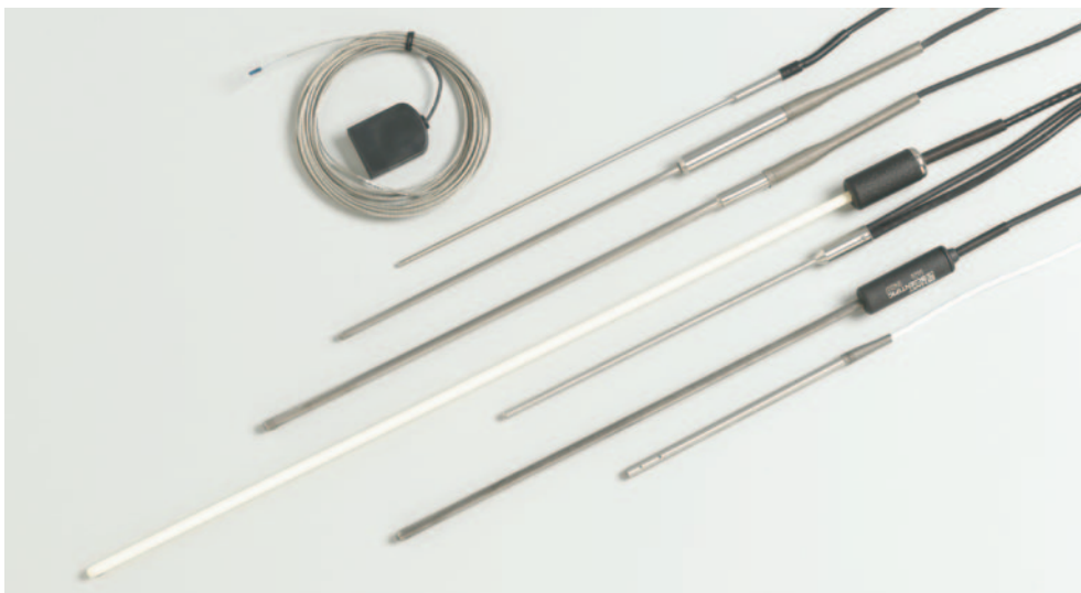
Caption to go here