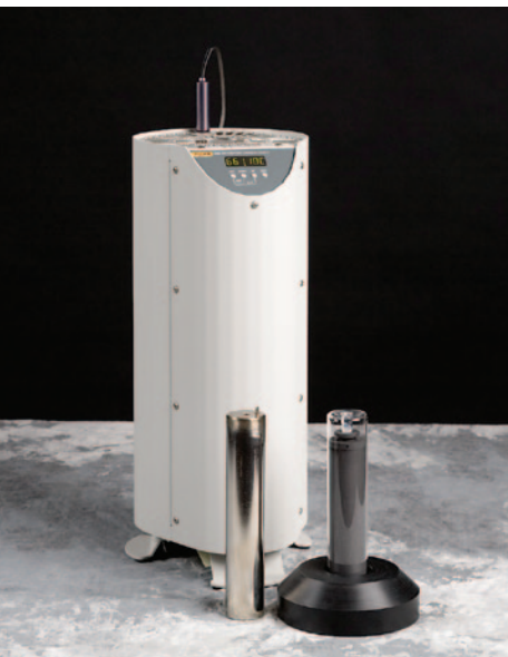
Table 5. ITS-90 fixed point calibration equipment