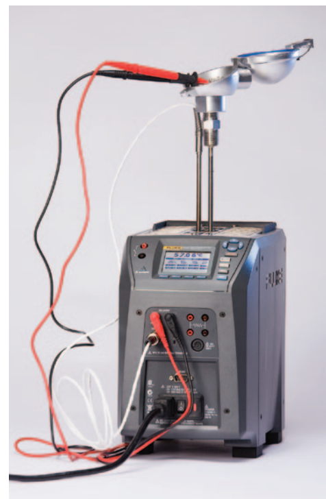
The 914X-P can act as the indicator for transmitters, thermocouples and RTDs and even a reference PRT to improve accuracy.