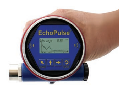
Echo Signal Return Curve Shown