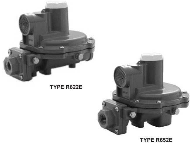
Figure 1. Type R622E and R652E 2-PSI Service Regulators