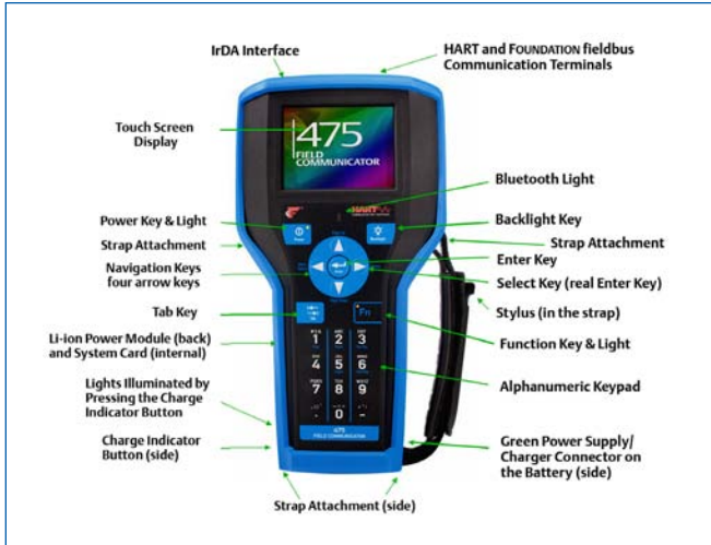
The 475 Field Communicator user interface is explained in the technical training.