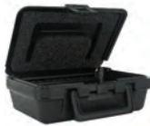
Protective Carrying Case