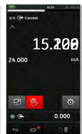
25% step manual advance