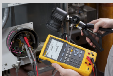
Pressure switch testing