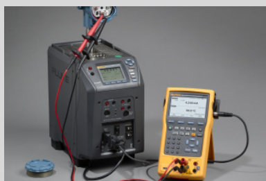
Testing a temperature transmitter using a dry well calibrator