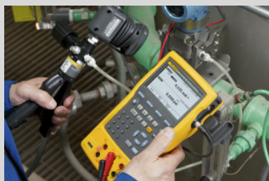
Pressure transmitter calibration