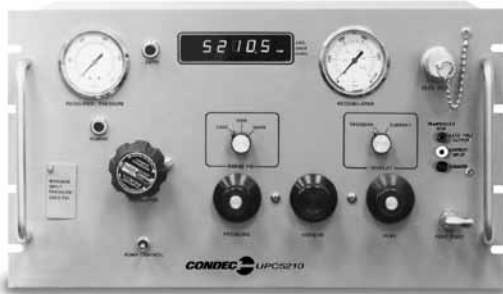
UPC5210 Rack-mounted Version of UPC5200

For special high-pressure applications, the portable UPC5200 or 19 inch rack-mount UPC5210 provides the ultimate in dependable, high-precision performance.