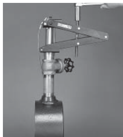
Model HTT - Hot Tap Tool