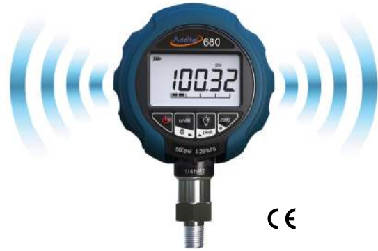
680 with data logging and wireless (optional)