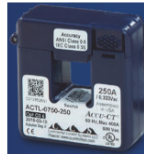
CCS Accu-CT Split-Core Current Transformer