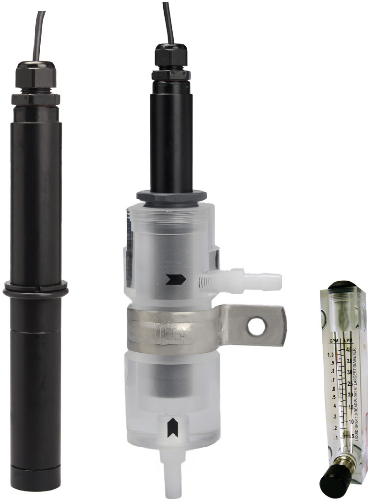
With AM-FCL-FC flow cell AM-FCL-FM flow meter