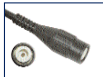
Lead with BNC: Insulated 6.5 ft (2m) coaxial cable with insulated BNC connector rated 600Vrms