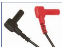
Leads: Double/reinforced 5 ft (1.5m) lead with safety 4mm banana plug