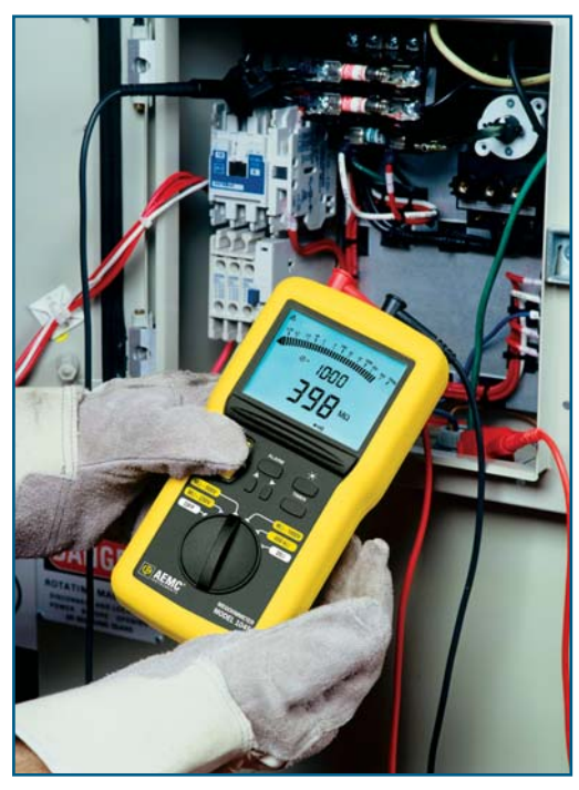
Easy-to-read digital/analog display (backlight on)