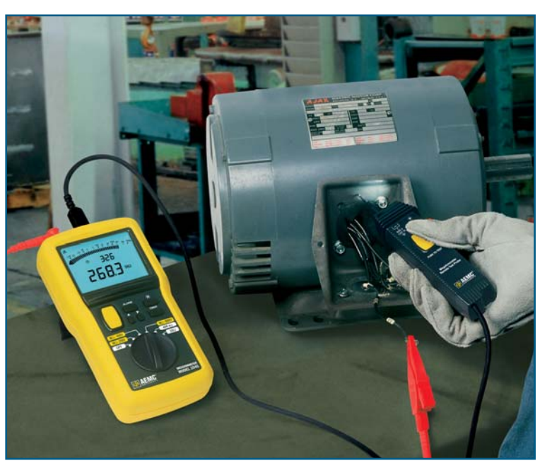
Remote probe used with Model 1045 to initiate a test at the motor. Target light provides good visibility of test area.