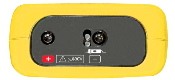
Models 1040 & 1045