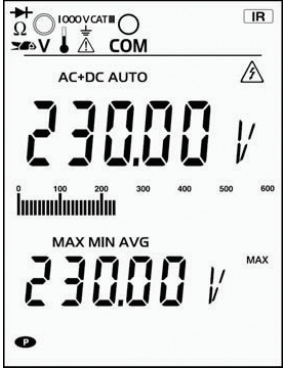
MAX/MIN AVG Displays maximum, minimum and average values