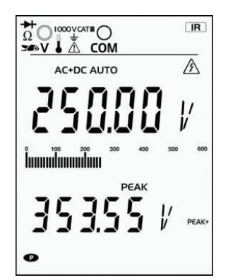
PEAK MODE Example of screen showing Peak+value