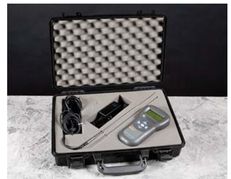
The Model 9318 Hard Carrying Case protects your Handheld Thermometer, a probe, and all your accessories.