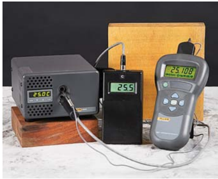
Handheld Thermometers make excellent reference standards for field calibrations.

A wide variety of standards-quality probes are available from Hart in many different shapes, sizes, and price ranges. Please refer to our selection of probes on page 60. The uncertainty of your probe should be added to the uncertainty of the meter to compute total system uncertainty.