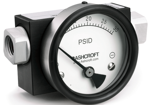
1130 2", 2½", 3½", 4", 4½", 6" dial sizes