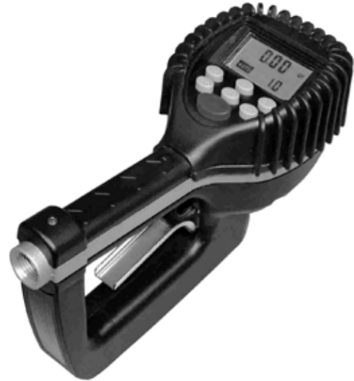
Electronic Preset Meter 2

Electronic accuracy will help you save time and money. The preset feature will allow users to perform other service tasks while fluid is dispensed.