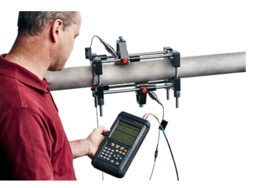
Optional pipe wall thickness gauge

Pipe wall thickness is a critical parameter used by the TransPort PT878GC flowmeter for clamp-on flow measurements. The thickness-gauge option allows accurate wall thickness measurement from outside the pipe.