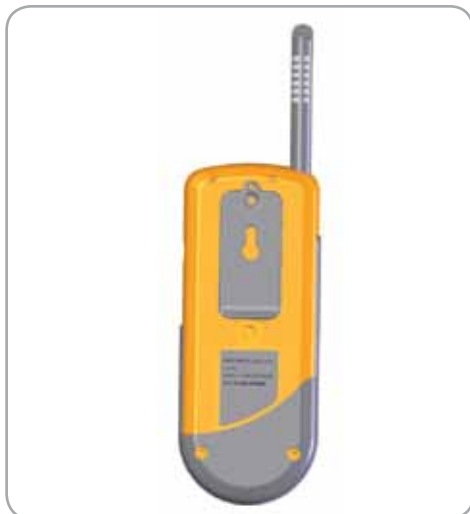
Rear view of the Psychlone shows a convenient belt clip and wall hanging mount