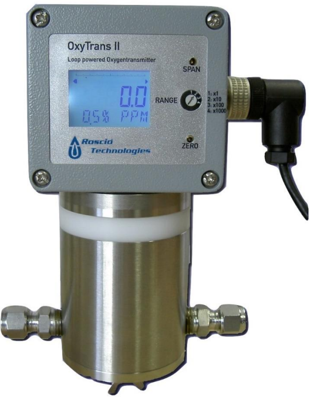
Figure 1: Oxytrans-II